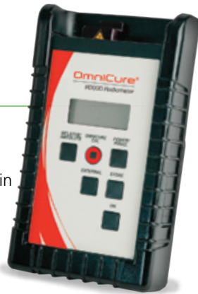
Optional Accessory: OmniCure R2000 Radiometer

Radiometry is an essential link for measuring the light output from a UV curing system in order to maintain a repeatable process. The OmniCure R2000 UV Radiometer can be combined with the OmniCure S1500 UV curing system to provide a complete curing station with unmatched control and repeatability.